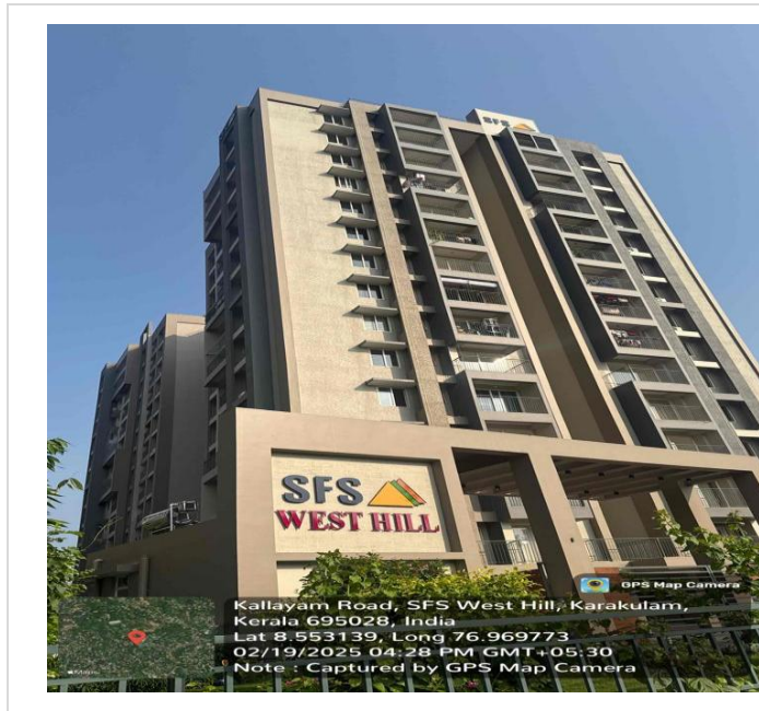
SFS West Hill - (Residential) – Trivandrum