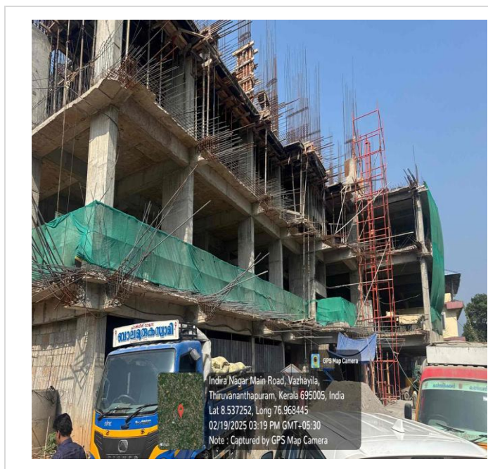
SFS Sky Garden - (Residential) – Trivandrum