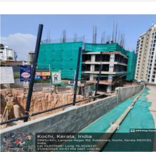
Skyline Matrix (Kochi)